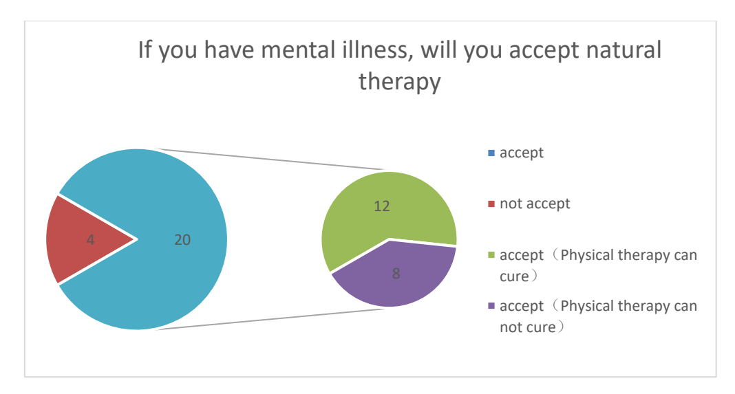
Figure 3 People's acceptance of nature-based therapy