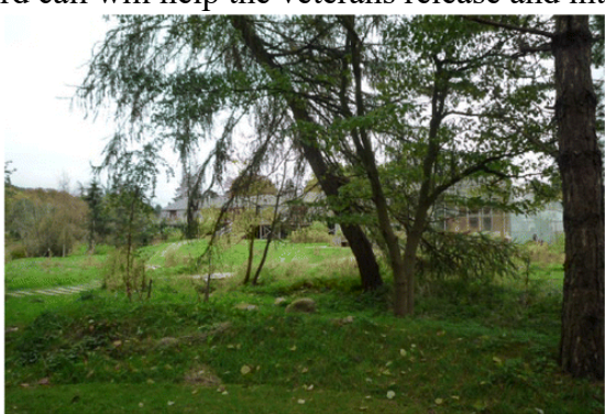
Figure 2 Environment of the corner of the garden ("Everything just seems much more right in nature")

Another application of nature-based sound is the veterans with Post-Traumatic Stress Disorder experience. "Coming home from war to continue a non-active military life is challenging for many soldiers. (Poulsen Dorthe Varning et al.1)" Physical injury are easier to be healed but the wound inside their heart are difficult to eliminate. There was a large garden with a bonfire site and participates had to go through a botanical garden to obtain the destination. On the way to the garden, some natural factors such as stream and bird call will help the veterans release and integrate into nature.